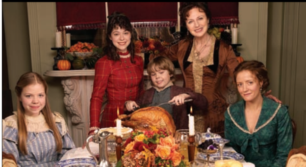
Jacqueline Bisset with family.

Anything that brings the luminous Jacqueline Bisset ( The Deep , Joan of Arc ) back to the screen has to be worth a closer look. Based on a short story by Louisa May Alcott, this family drama set in the 1880s is a timeless story about a headstrong girl yearning to be a writer. Tatiana Maslany ( Diary of the Dead ) plays Tilly, a 17-year-old who writes a letter to the grandmother she's never met, signing her mother's name. However, her mother has been estranged from the family for marrying a man they disapproved of, and Tilly's action sets off a series of events that could force her to choose between a life of wealth and splendor with her grandmother, or poverty with her newly widowed mother. ♦