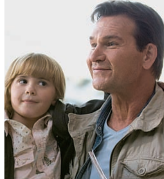
Patrick Swayze

The holidays are looking grim for the Saunders family. They've moved to a new town where they don't know anyone, they're totally broke, and Christmas spirit is nowhere in sight. Things begin to change when 12-year old Brian and 6-year old Mary find a bag full of money. Not knowing that the bills are counterfeit, they head for the mall in search of holiday cheer. The fun begins when the crooks who stole the money come after the kids at the mall filled with holiday shoppers. Stars Carmen Electra ( Scary Movie 4 ) and Patrick Swayze ( Dirty Dancing ). ♦