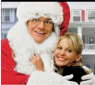
Tom Arnold with Candace Cameron Bure.

This heartwarming family film gives us Tom Arnold ( True Lies ) as a father and owner of Santaville, a small theme park attraction in Vermont on the verge of bankruptcy. His daughter, Candace Cameron Bure ( Full House ), no longer believes in the magic of Christmas, but in an inspiring story of faith and magic, father and daughter come together to save their magical wonderland. ♦